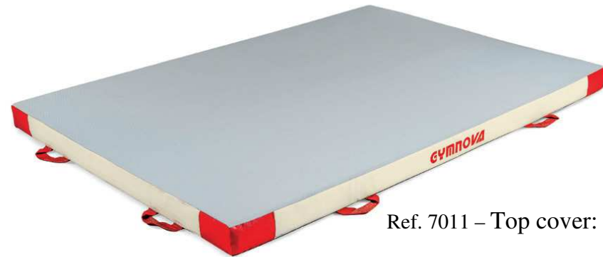
Ref. 7011 – Top cover: Jersey