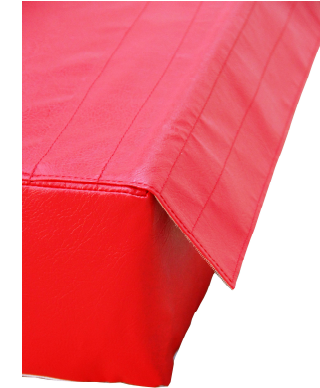
Joining hook and loop