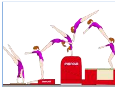
Learning handsprings off the vault