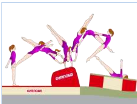
Learning handsprings with half twist